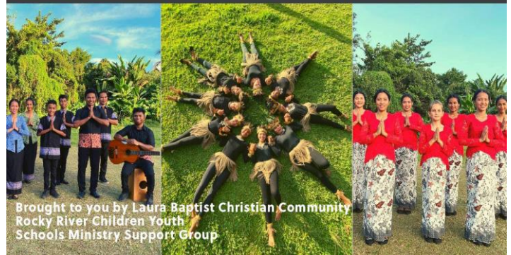
Brought to you by Laura Baptist Christian Community Rocky River Children Youth Schools Ministry Support Group

Our choir is talented, energetic and uplifting. You can expect to experience a performance filled with traditional Indonesian dances, testimonies from our youth and both English and Indonesian songs. We are excited to be on tour!